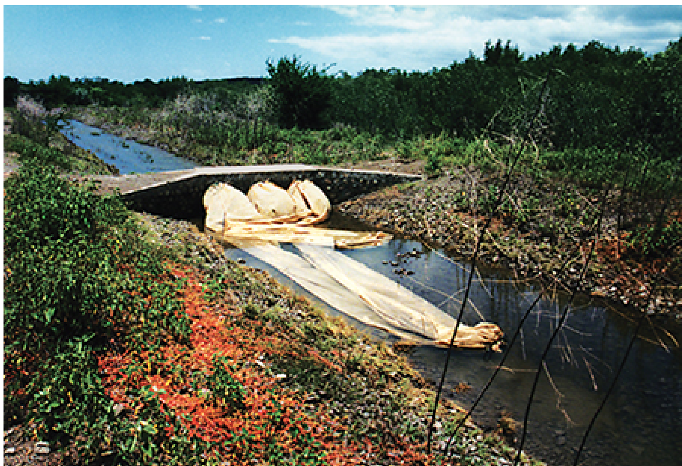
Incoming water flowed through a series of filters to eliminate hosts that could harbor shrimp viruses.