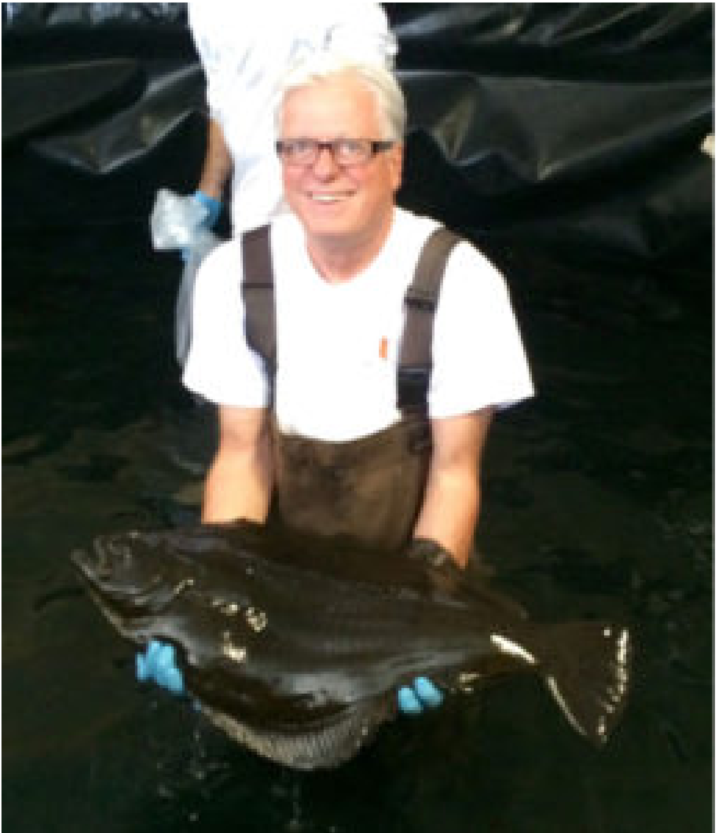
Author – here with broodstock Japanese flounder broodstock – believes that it is not what we know but what we don't that still poses major challenges to controlled production of marine fish seedstock.