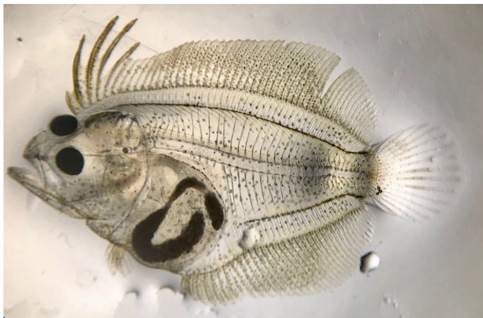
Japanese flounder routinely yield 40 to 60 percent survival rates during larviculture.

For example, hatchery technologies that succeed in consistently mass-producing fingerlings of temperate species such as sea bream ( Sparus aurata ) and sea bass ( Dicentrarchus labrax ) in hatcheries in European countries have not been effective when applied to tropical species of snappers. Likewise, the same methods used for raising various groupers ( Epinephelus spp ) and snapper ( Lutjanus spp ) in Asian countries yield variable yet very high survival rates in some species and very low with others.