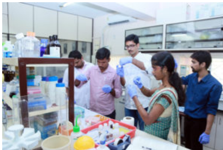
Participants in the hands-on, PCR training program.

A total of 46 applications were received from private and government PCR-service-providing labs, hatcheries and research institutions. Out of these, 21 laboratories across the shrimp farming regions of Andhra Pradesh and Tamil Nadu successfully completed the PCR ring test. The second PCR ring testing exercise was conducted in the year 2009 by ICAR-CIBA and MPEDA, in which 34 laboratories participated and 31 participants provided their results – 21 laboratories successfully completed the second PCR ring testing exercise in the year 2009.