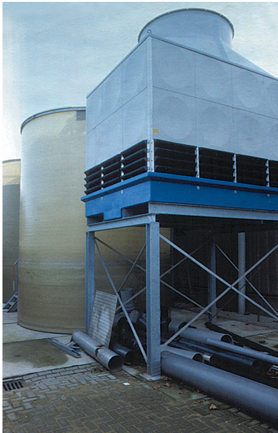
A new cooling unit (right) joined the denitrification units at Nijvis.

The government recently corrected this situation through strict legislation that limits the amount of minerals a farmer can apply. Surface and groundwater also are strongly protected, and users of these resources have to pay high levies.