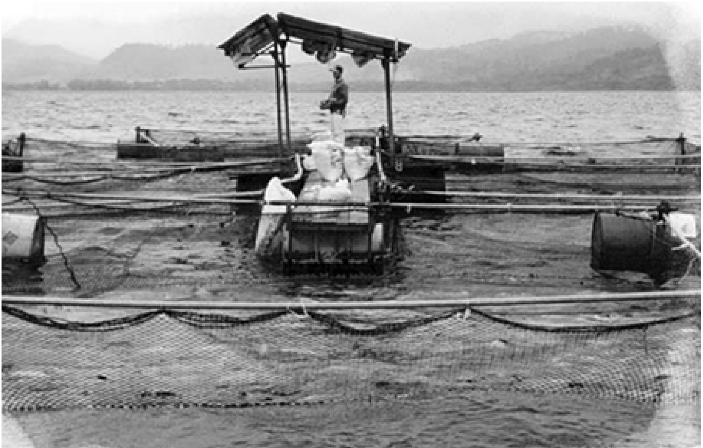
Fig. 1: Cages for tilapia culture in Honduras are typically suspended from a metal frame supported by drums.