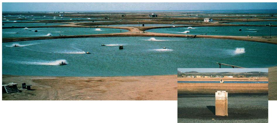
Fig. 2: This view of a production pond shows the tip of the central drainage structure and the current created by the aerators: four paddlewheels on the outer circle, and three air injectors in the center. Inset: Central drain and clean bottom with no black deposits four days after harvest.