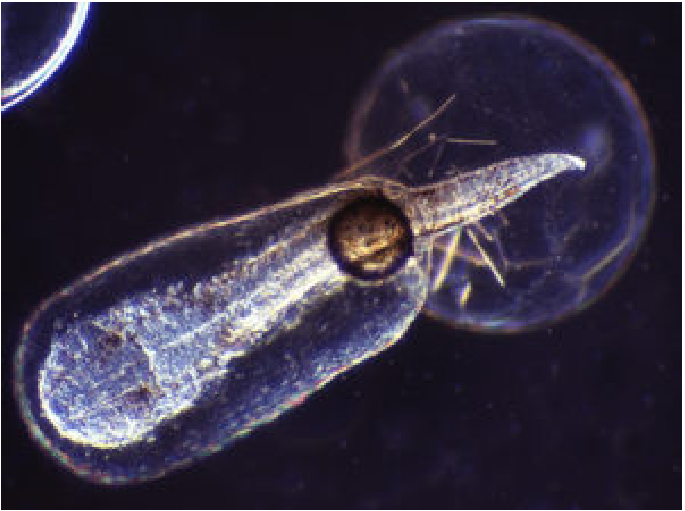
Spotted seatrout hatching, 1.5 mm length.