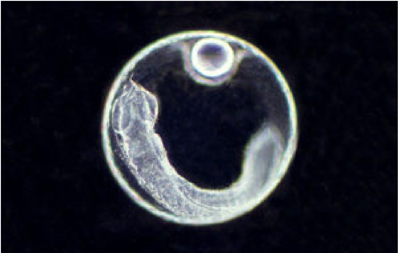
Red drum eggs are obtained through hormone treatment and stripping.

More than 33,000 juvenile and adult fish have been produced at the Fort Pierce, Florida, USA, facility, and more than 25,000 of those were released. At 39.7 percent, the best survival to juvenile stage has been achieved in sheepshead ( Archosargus probatocephalus ). Other encouraging survival rates include those for striped mullet ( Mugil cephalus ), 30.0 percent; spotted sea trout ( Cynoscion nebulosus ), 12.5 percent; common snook ( Centropomus undecimalis ), 7.0 percent; and Nassau groupers ( Epinephelus striatus ), 5.0 percent.