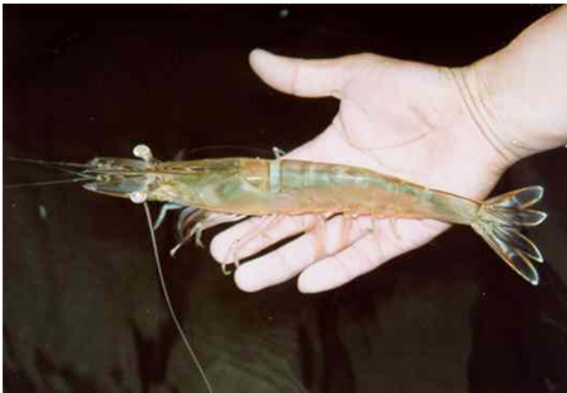
A ripe female P. chinensis . WSSV, HPV, and IHNV have been reported in this species.