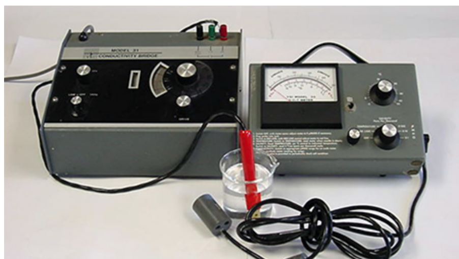
Fig. 1: Lab bench (left) and portable conductivity meters.

Most aquafarmers are accustomed to measuring the salinity of their production systems with salinity refractometers. The refractive index of water changes in a predictable way with increasing salinity. Salinity refractometers are calibrated so they provide direct readings of salinity.