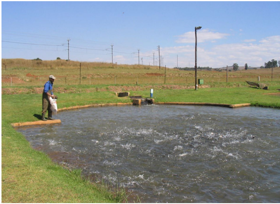
Feeding trout at a farm in South Africa.

The aquaculture sector in South Africa is relatively small and has not been extensively developed. However, the South African Government has identified this sector as a development priority for its potential to create economic, job creation and food security opportunities.