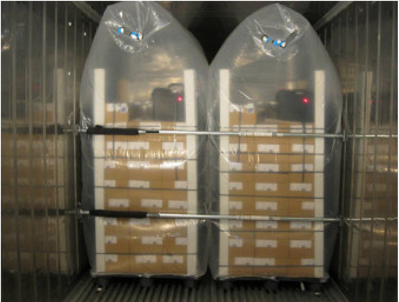
A full pallet of farmed salmon in a BluWrap container about to be opened at destination facility.