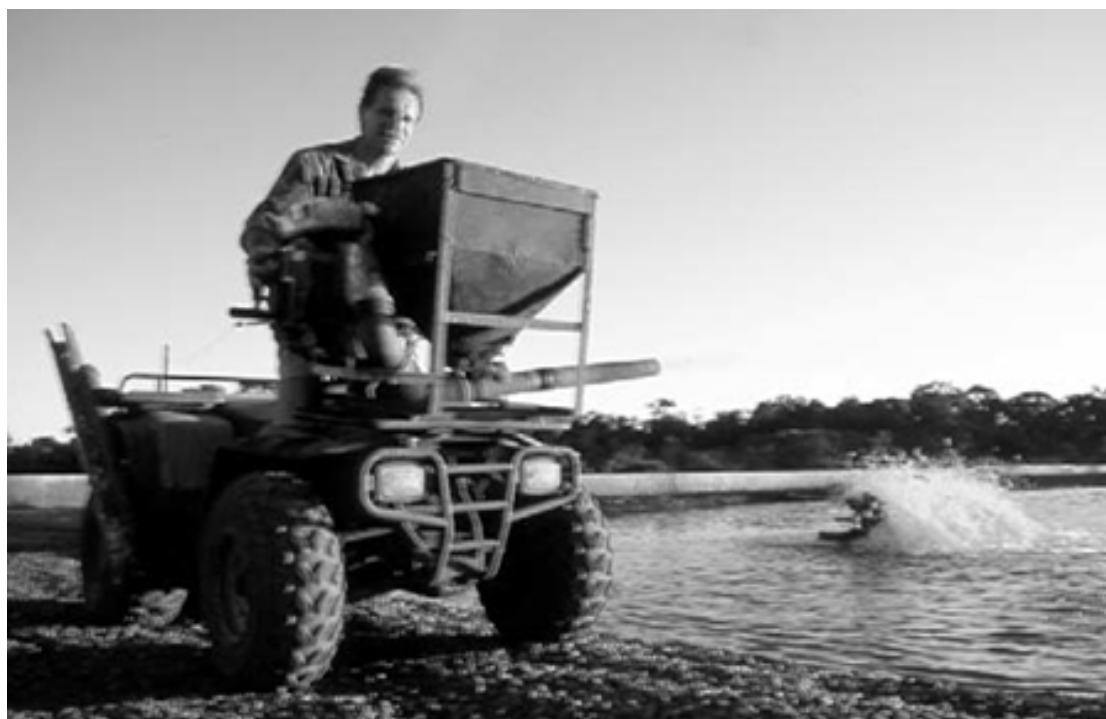
Fig. 2: Feed is usually delivered by motor-driven blowers at Australian shrimp farms.

P. japonicus feeds are imported from Japan and Taiwan. Both have a