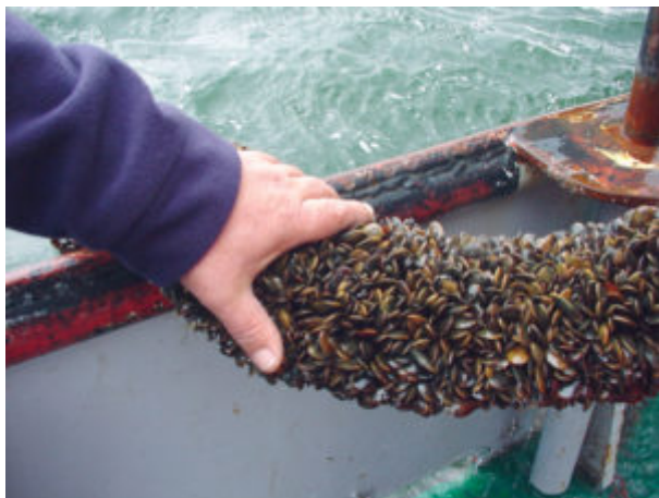
Mussel seed on a collector rope.

Shellfish culture in the Netherlands is mainly based on the production of blue mussels ( Mytilus edulis ). Traditional bottom culture is carried out on 4,000-hectare (ha) culture plots in the Wadden Sea in the north and 2,250-ha plots in the Oosterschelde, in the southwest. Annual production has decreased from 81,000 metric tons (MT) on average in the 1990s to 47,000 MT in the past eight years (Fig. 1). The average landing values increased from 48 million to 63 million euros (U.S. $61.2 million to $80.3 million) over these periods.