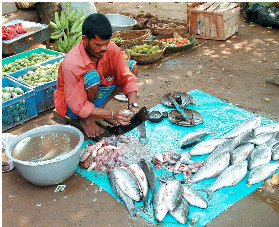
Rohu are a popular fish choice at this market in Orissa, India.

With a population of 1.04 billion and annual growth of about 18 million, India sets major demands for increased food production. But the availability of land and water resources is depleting day by day. Therefore, an increase in unit-area productivity is strongly required to meet the country's food requirements.