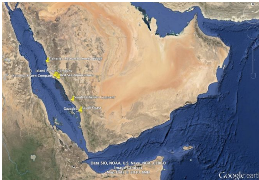
Fig. 1: Locations of shrimp farming facilities in the Kingdom of Saudi Arabia.

The shrimp farming industry in the Kingdom of Saudi Arabia (KSA) was started in 1995 with the culture of the Indian white shrimp ( Fenneropenaeus indicus ) grown under semi-intensive production conditions. The positive results obtained with this species in terms of growth rate, survival and flesh quality led to its commercialization as a premium shrimp in the international markets. The two regions where the shrimp farming industry developed in the KSA are located on the Red Sea shores, in Jizan in the south and in Al-lith in the north (Fig. 1). Both regions have excellent water quality and have optimal environments for shrimp farming.