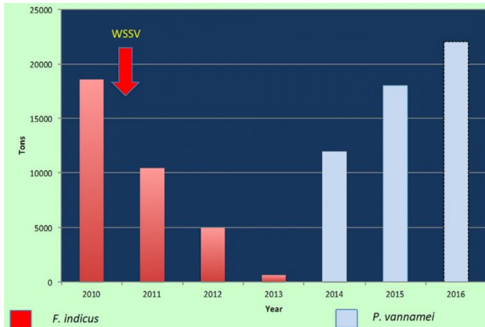
Fig 3. Farmed shrimp production in the KSA since 2010-2015, and forecast for 2016.