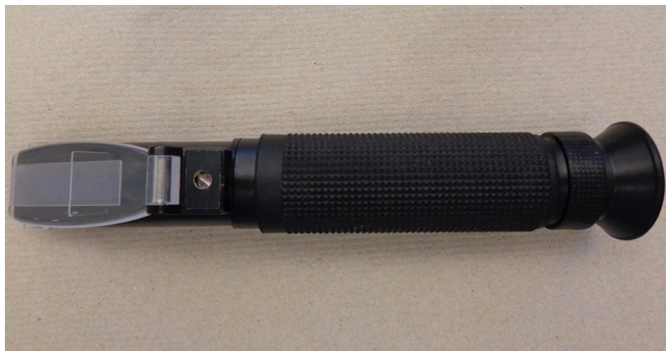
Fig. 4. A handheld, salinity refractometer.

Some aquaculture species such as ictalurid catfish, pangasius and common carp grow best at salinities of <5 g/L; species such as Atlantic salmon, tilapia and rainbow trout grow well up to 20 g/L salinity; estuarine species such as penaeid shrimp grow well at salinities of 2 to 40 g/L. Marine and estuarine species can be farmed in inland saline water, but they may not survive and grow well in spite of adequate salinity. This results from ionic imbalance caused by low concentrations of K^+ , Mg^{2+} , and Ca^{2+} or a combination of these cations. Mineral supplements are applied to increase concentrations of major ions.