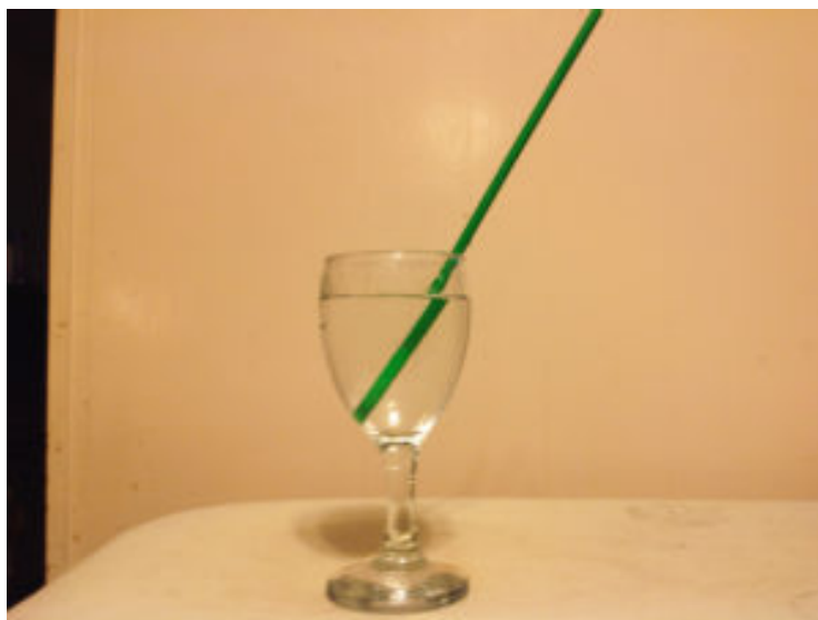
Fig. 3: Visual evidence that light is refracted by water.

The refractive index of water increases as a function of density, and is influenced also by wavelength of measurement, atmospheric pressure, and temperature. A good quality, handheld, salinity refractometers (Fig. 4) measure salinities of 1 to 60 mg/L to one decimal place. They are widely used to measure salinity at aquaculture facilities supplied with inland, saline water, estuarine water, or seawater.