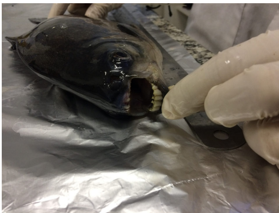
Pacu ( Piaractus mesopotamicus ), a South American species often raised in aquaculture.

Johan Sáenz and collaborators evaluated the response of the gut microbial community of Brazilian freshwater fish pacu ( Piaractus mesopotamicus ) to the antibiotic florfenicol for 34 days. The study was divided into three phases – pre-exposition, exposition and post-exposition to the antibiotic. Food was mixed with florfenicol during the exposition phase for 10 days. Throughout each phase, samples were taken from the fish's digestive tracts and microbial DNA extracted, sequenced and analyzed.