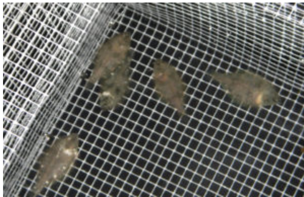
Study fish were placed in nested cages for stability and added predator control.

The hatchery feeds examined included two traditional feeds: a 0.5- to 0.8-mm pelleted feed with 60 percent protein, 15 percent lipid and 10 percent ash; and artemia brine shrimp with 55 percent protein and 35 percent ash grown out on Spirulina to subadult stages. The two nontraditional feeds were white worms ( Enchytraeus albidus ), a natural component of the winter flounder diet with 75 percent protein and 15 percent lipid; and burying marine amphipods ( Leptochierus plumosus ), another item in the natural flounder diet with 55 percent protein and 35 percent ash.