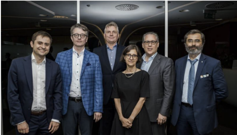
The Proteon Pharmaceuticals team.

Poland-based Proteon Pharmaceuticals secured a €21 million investment to accelerate the commercialization of its bacteriophage-based products, which it says can reduce aquaculture's reliance on antibiotics, the company announced on Tuesday.