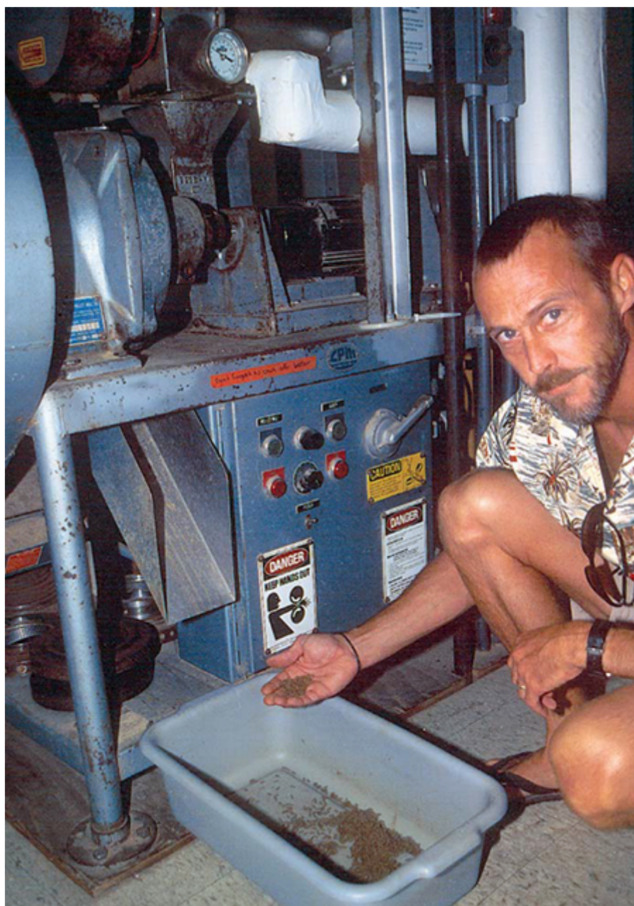
Experimental pellet mill used to produce 3-mm-diameter pellets.