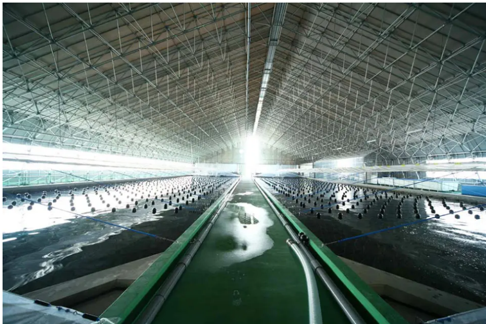
IMTE's shrimp production plant in Myoko City, Niigata Prefecture, Japan.

RAS salmon has a head start, but land-based farming may prove to be key to the country's shrimp supply