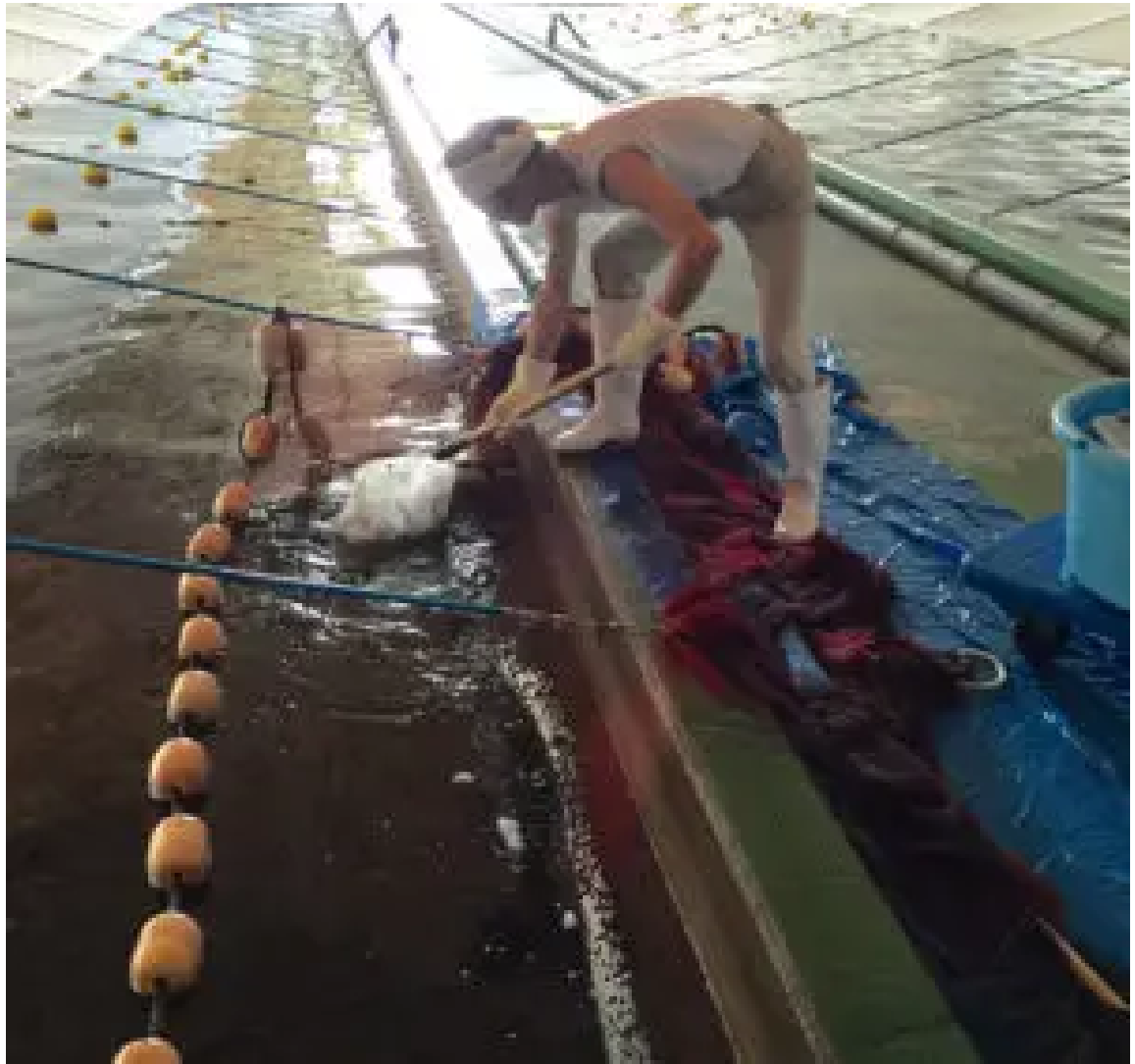
Harvesting shrimp at the IMTE whiteleg shrimp plant in Myoko City, Niigata Prefecture.