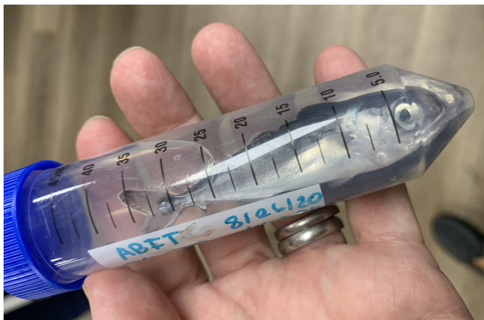
A young bluefin tuna taken for laboratory tests.