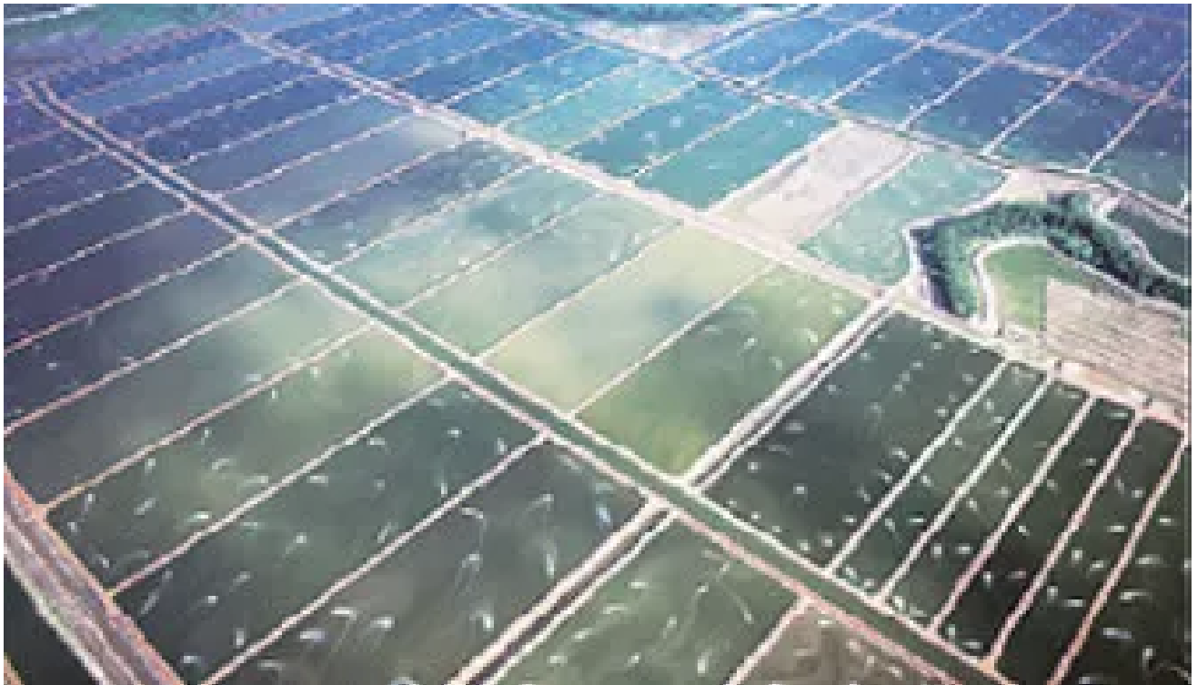
Aerial view of shrimp growout ponds at Potiporã Aquacultura. It is the largest shrimp farm in Brazil.

indicating the minimum and maximum levels of basic nutrients. Originally, Potiporã adopted these quality standards set by the feed manufacturer, allowing a variation of \pm 5.5 percent.