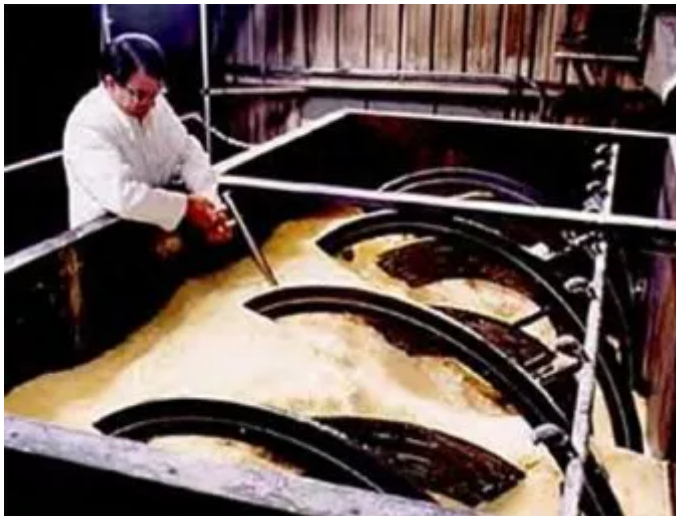
View of a horizontal, continuous ribbon mixer.

Before starting the mixing process, the operator must ensure that equipment is in good operating conditions. At least every two months, the mixer operator and the maintenance supervisor must check the condition of the parts of the mixer, including state of wear of the paddles or ribbons; build-up of material on paddles/ribbons; and if in the case of a clam shell or drop bottom mixer, ensure that the gates close tightly. Any of these can affect the degree of homogeneity of the mix or produce a poor mix.