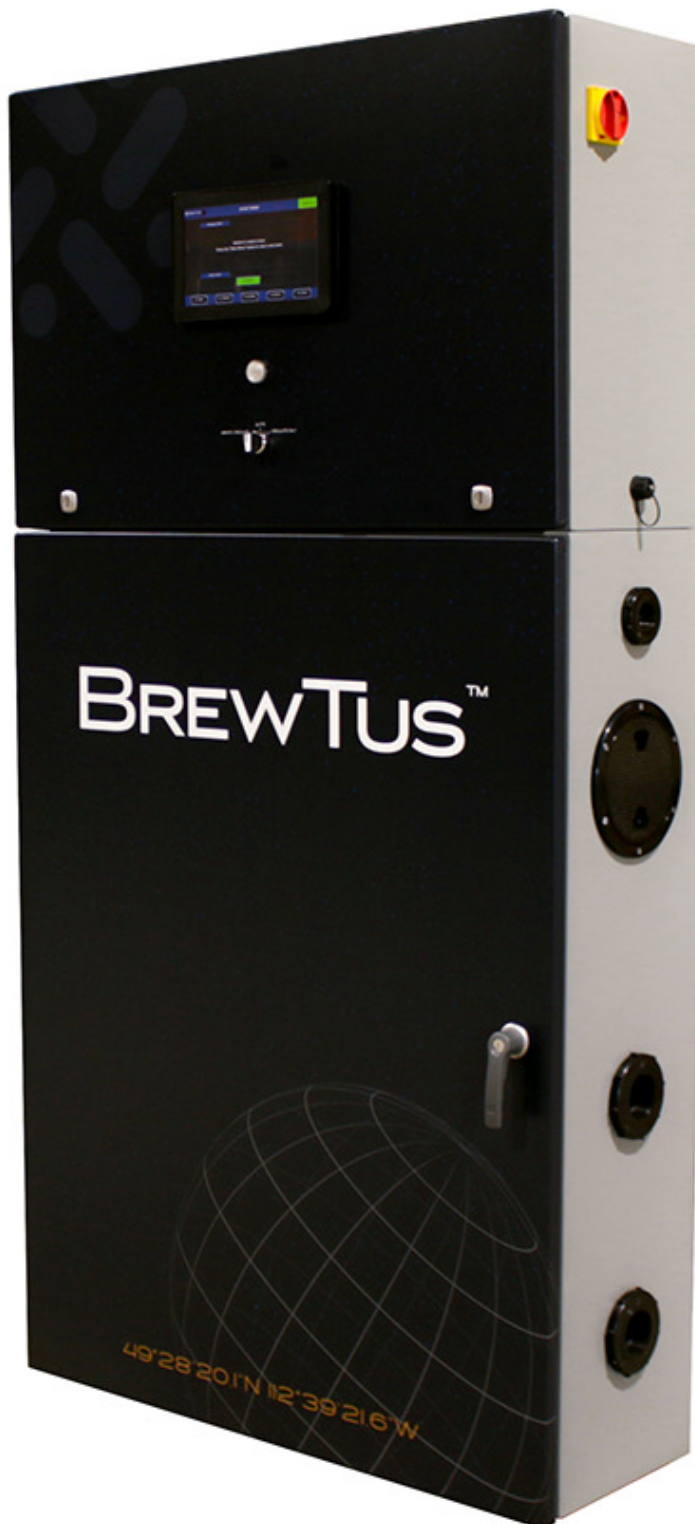
The BrewTus bioreactor.

“Historical [geosmin] levels were highly variable. Sometimes acceptable, sometimes not,” said Robinson. “The variation usually correlated to changes in water quality, the amount of new water added, fish biomass or feed rate. However, since biofilter seeding started, these changes don’t seem to have as large an impact on geosmin levels. Historically, no intervention