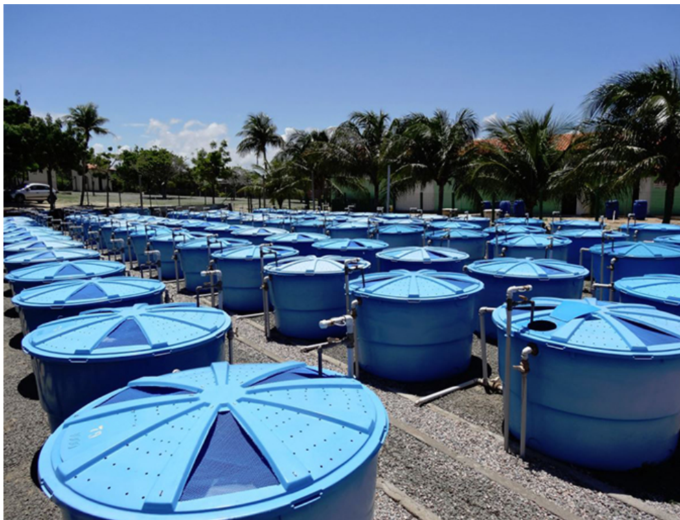
View of the experimental rearing system used in the study.

In this study – which summarizes the original publication in Aquaculture 463 (2016) 16-21 – we evaluated the effect of graded levels of dietary methionine and stocking density on the growth performance of juvenile Pacific white shrimp cultured in a green-water rearing system.