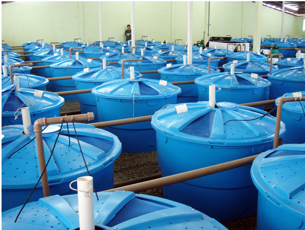
Experimental rearing system at LABOMAR in Brazil.

Trends toward improvements in feed intake observed for diets with reduced fishmeal and HMTBa supplementation