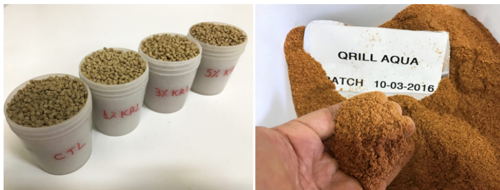
Fig. 2: Laboratory-made feeds (A). Krill meal used in the study (B, from Aker BioMarine).