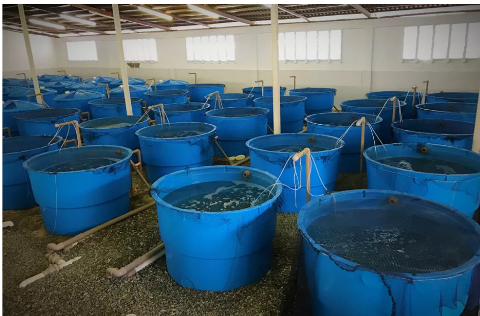
Fig. 3: Indoor tanks carried four feeding trays to evaluate feed attractiveness.