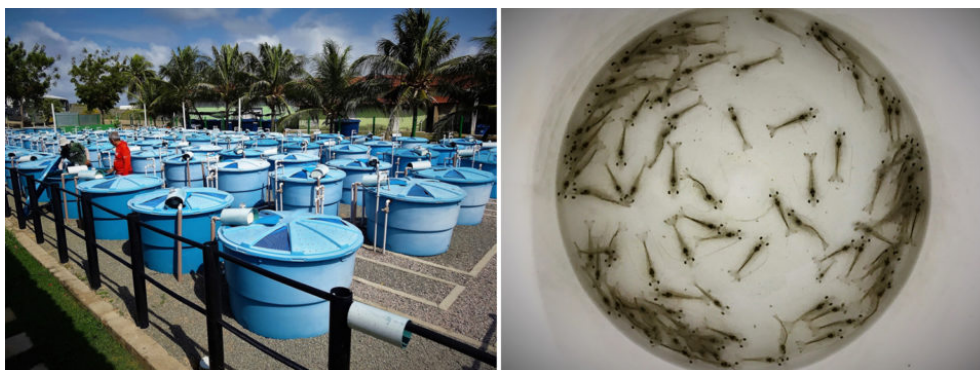
Figure 1. Outdoor tanks at LABOMAR used in the study (A). Juvenile shrimp at stocking (B) for study.

This study was carried out at the LABOMAR aquaculture facilities in northeastern Brazil. Specific-pathogen free (SPF) shrimp of 1.13 \pm 0.19 grams were stocked in 30 outdoor tanks of 1 cubic meter under 100 animals per square meter and raised for 71 days (Fig. 1). Shrimp were fed four lab-made feeds using an automatic feeding device that operated four to 10 times a day between 7 a.m. and 5 p.m. Feeds were adjusted bi-weekly by sampling and weighing individually five shrimp per rearing tank.