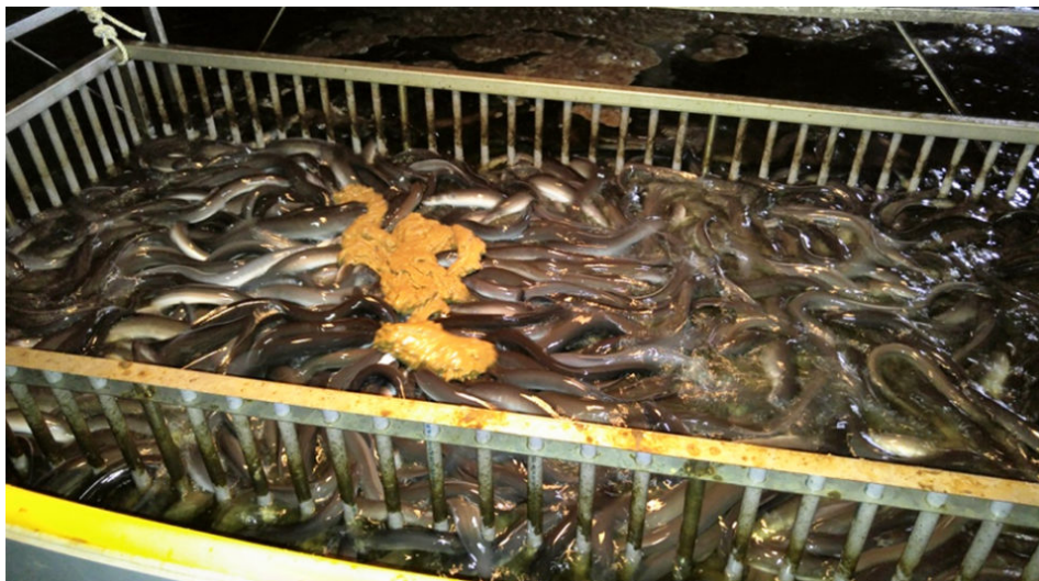
Feeding of mature Japanese eels using paste feed.