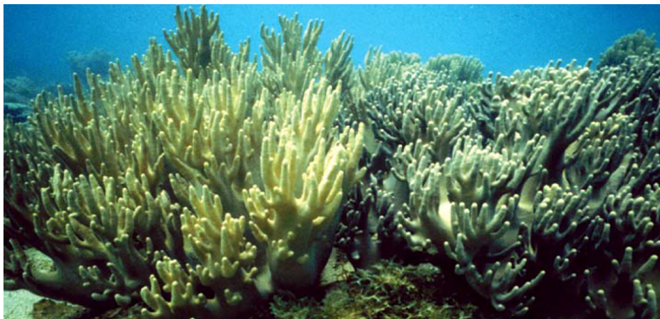
Sinularia maxima S. polydactyla at Piti Bomb Holes, Guam.

Natural hybridization in the marine environment is an important mechanism for the production of biodiversity. Mass-spawning marine invertebrates, in particular, have the potential for hybridization when gametes mix in the water column. “Gene shuffling” associated with hybridization can result in a mosaic of phenotypic characteristics expressed in the first and subsequent backcrossed generations that can mediate a variety of ecological interactions.