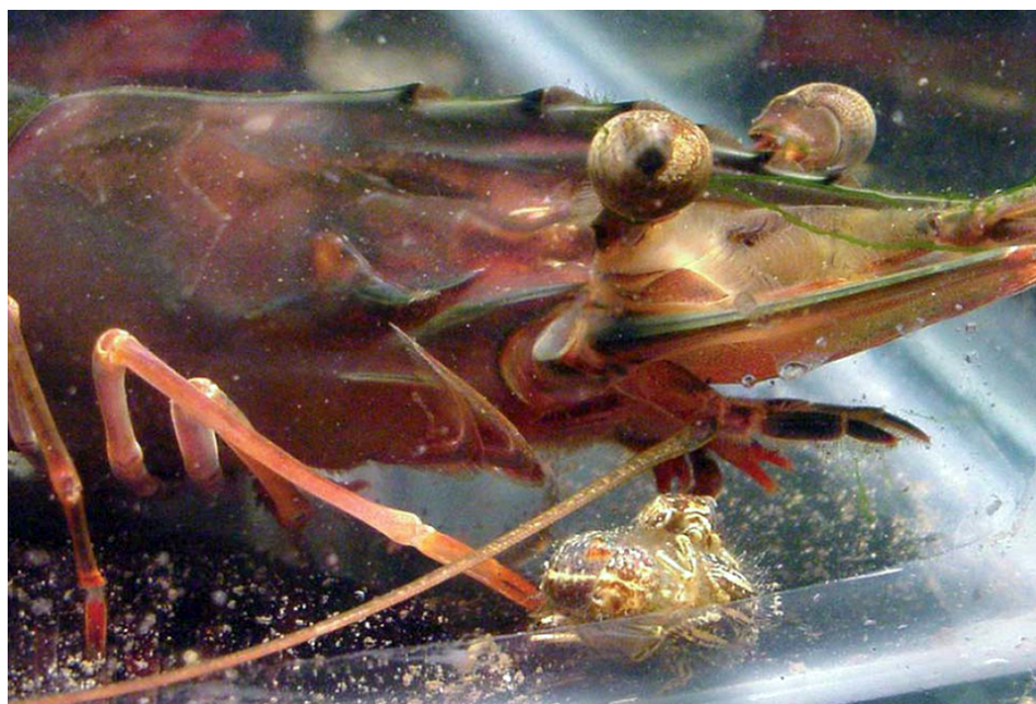
Penaeus monodon broodstock feeding on hermit crabs.

It may be possible to mimic their nutritional profile in artificial diets