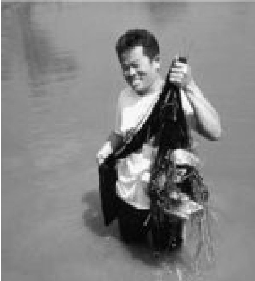
Sampling tilapia in a green water pond fertilized with synthetic fertilizers.

only be fed to naturally piscivorous fish such as salmon and sea bass.