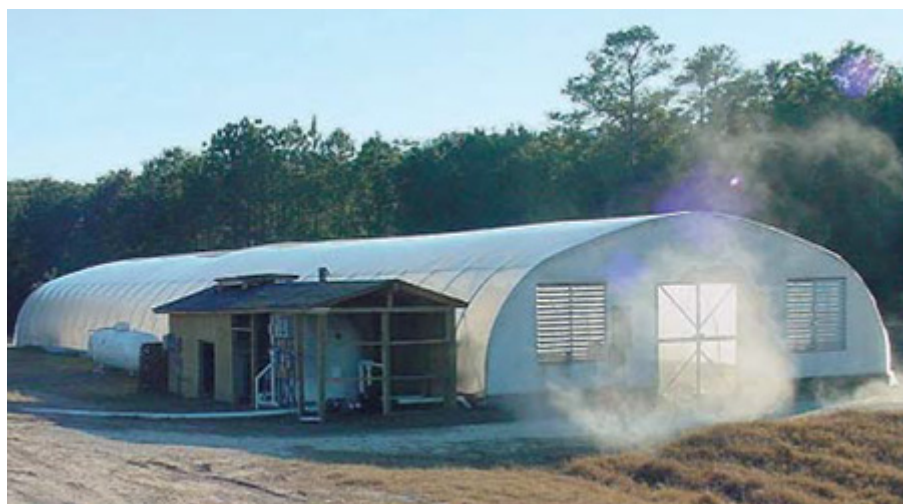
Greenhouse exterior at Waddell Mariculture Center.

Several factors have limited the growth and expansion of the pond-based shrimp-farming industry in the United States. Extensive and semi-intensive pond production systems are typically managed with high rates of water exchange, and this production method raises environmental concerns regarding effluent discharge into receiving water. Pond based culture systems are also typically restricted to coastal regions, where land costs are inherently high.