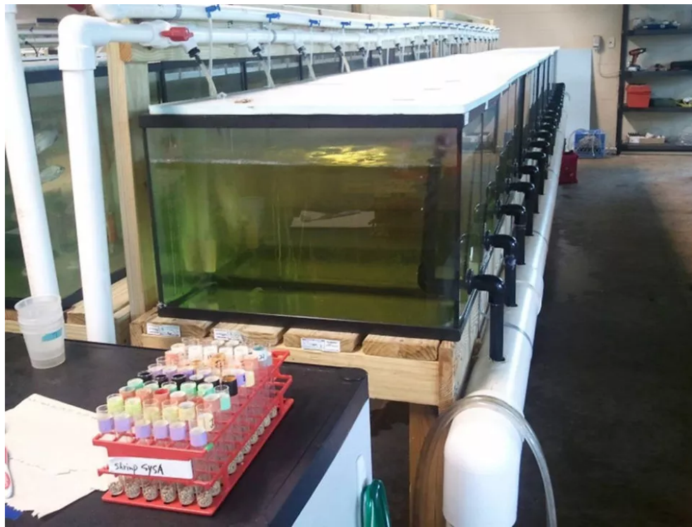
View of the experimental system used in the study.

We conducted two growth trials at E. W. Shell Fisheries Research Station in Auburn (Alabama, USA). In trial 1, five experimental diets were prepared containing increasing levels of GDDY (0, 50, 100, 150, and 200 grams/kg of diet) as a replacement of SE-SBM. In trial 2, three experimental diets were formulated to have increasing levels of a commercial GDDY (0, 200, 300 grams/kg of diet), and two additional diets were prepared to supplement commercial lysine to diets 200 and 300 GDDY in order to determine if lysine was limiting. All experimental diets were prepared to be isonitrogenous and isolipidic (approximately 350 grams/kg crude protein with 80 grams/kg lipid), replacing SBM by GDDY and balancing with fish oil and corn gluten meal.