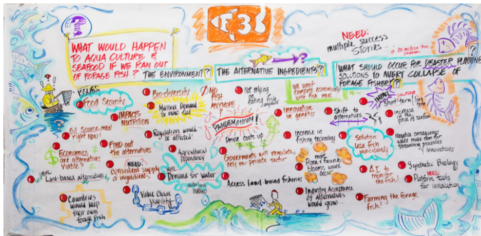
Fig. 1: An artistic rendition of the potential solutions in the event of a disaster and we ran out of forage fish.

In February, more than 100 aquaculture leaders met in San Francisco ( https://www.aquaculturealliance.org/advocate/aquafeed-moonshots-f3-talent-show/ ), as part of the second meeting of the Future of Fish Feed (F3) challenge. After an opening keynote by Dr. Halley Froehlich ( https://www.aquaculturealliance.org/advocate/scientific-startup/ ), on the “Status of Forage Fish Under ‘Business as Usual’ Scenarios”, participants were asked to address what would happen if we ran out of forage fish. This question was discussed in small groups, with each group reporting out their top ideas, and an artist captured those ideas on a large canvas.