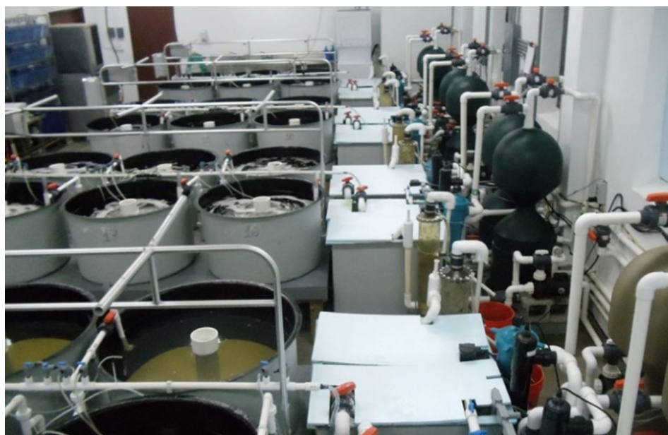
View of the experimental setup, with fish tanks and life-support systems.