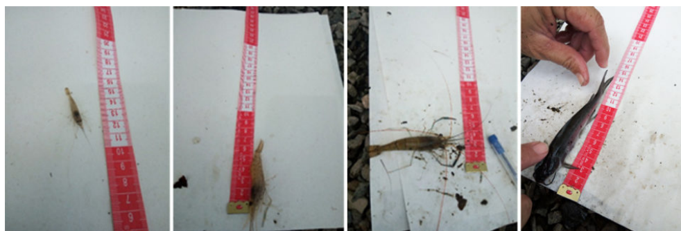
Representative prawns from the smallest to the largest sizes produced, and channel catfish (r).

Fig. 1 shows prawn size distribution, and the normal distribution of two different populations is evident. The largest prawns are those that were stocked first and had final weights from 2 grams to over 5 grams. The small prawns are from the population stocked a month later and had final weights from less than 0.5 grams and up to 2 grams. The size disparity increased as the prawns grow larger.