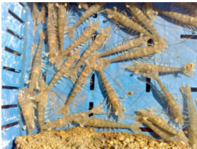
Healthy shrimp from initial breeding are used as broodstock.

The wild spawner pairs produced the highest mean numbers of eggs per spawning (298,817 ± 790), while the pond-reared broodstock produced significantly fewer eggs per spawning. The hatch rate of eggs was significantly different ( P < 0.05 ) among the three broodstock groups, ranging from a mean of 75.82 ± 6.12