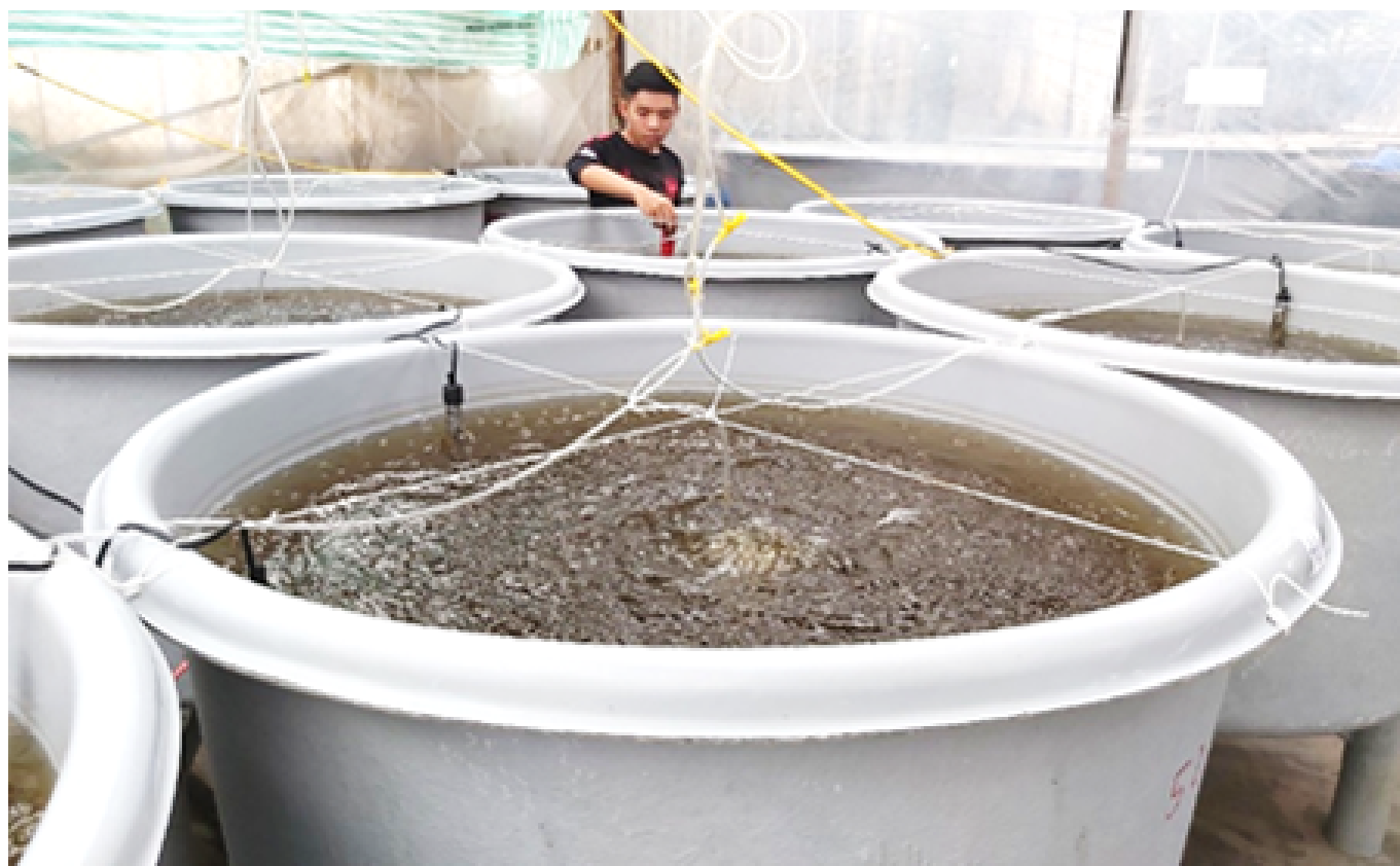
Fig. 1: Phase 1 of the study: adding vitamins and amino acids in the water of an experimental tank during shrimp larval development.