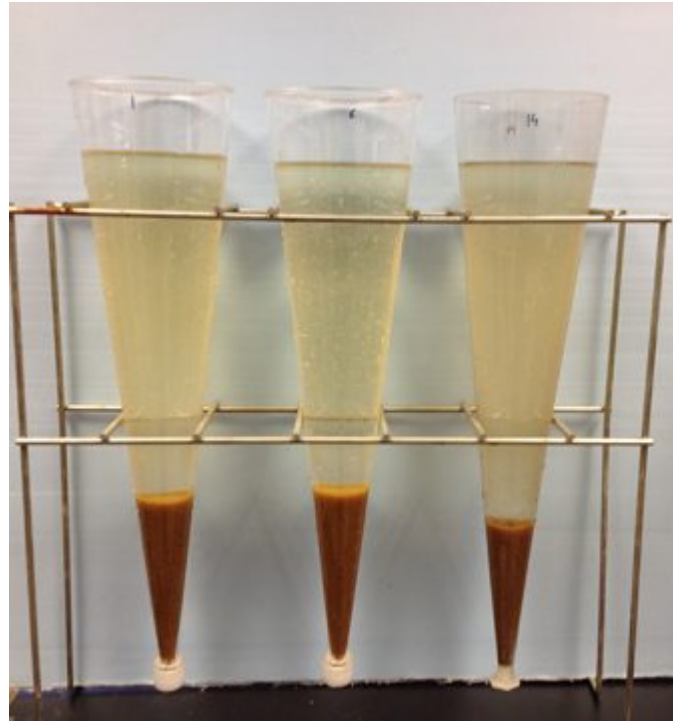
Imhoff cone with biofloc suspended solids at the highest stocking density.

Because significant capital investment will be required to start any intensive BFT culture of fathead minnows, and also because the degree of investment in such a system will depend on a variety of different factors, additional studies will be needed to evaluate the economic feasibility of BFT for commercial fathead minnow culture.