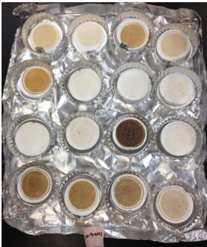
Samples prepared for total suspended solids analysis.

A total of 50 fish in each tank were sampled for whole-body cortisol analysis. Sampled fish were euthanized with 100 mg/L of tricaine methane sulfonate and frozen at minus-20 degrees-C until analysis. A whole-body cortisol extraction method was applied, and cortisol extracts were analyzed with commercial cortisol ELISA kits. Statistical analysis procedures used and additional details are available in the original publication.