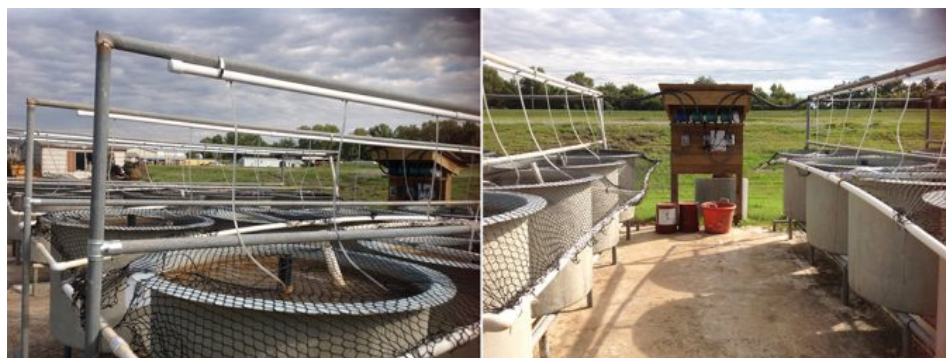
Views of the experimental system used in the study.

No studies have evaluated the potential of BFT for baitfish production. In our study, summarized here from the original 2017 publication (Journal of the World Aquaculture Society doi: 10.1111/jwas.12387), we tested the suitability of BFT for rearing fathead minnows for an extended period to cold temperature months, and evaluated stocking density effects on these fishes when reared in BFT systems.