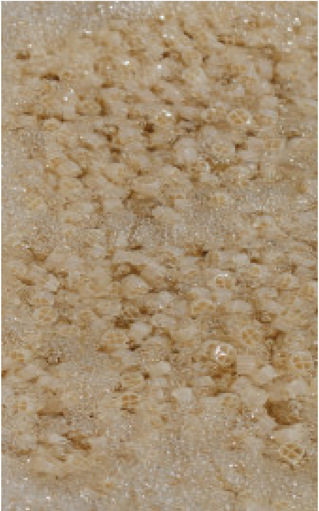
After four months, the "seasoned" media looks brownish and has less buoyancy.