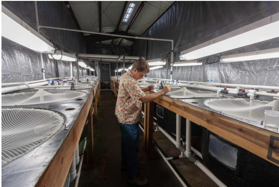
View of the study experimental setup.