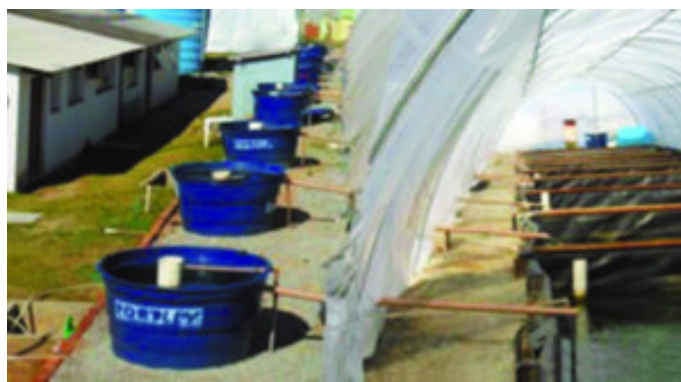
Greenhouse shrimp production with linear tanks.

In another experiment, concentrations of nitrogen compounds differed when compared to different total suspended solids (TSS) concentrations during the formation of biofloc. Higher TSS concentrations resulted in higher concentrations of nitrite.