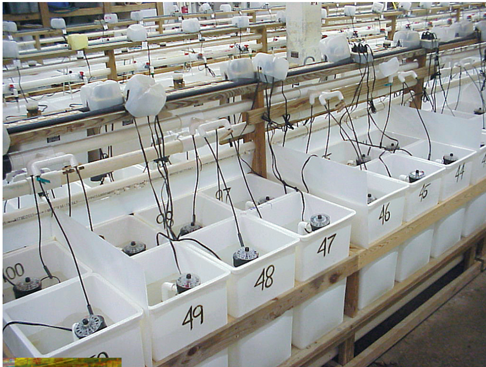
Culture tanks used for sterol growth trial at TAES Shrimp Mariculture Research.

Cholesterol is an essential dietary nutrient in shrimp. Like other crustaceans, shrimp cannot synthesize cholesterol, so dietary cholesterol is necessary for the animals' growth and survival.