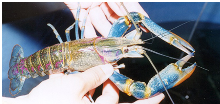
A male redclaw ( Cherax quadricarinatus ).

The redclaw ( Cherax quadricarinatus ) is an Australian freshwater crayfish that was introduced to Mexico in the 1990s. It is commercially produced mainly in the northeast region of the country using aquafeeds formulated for fish, penaeid shrimp, and freshwater prawns.