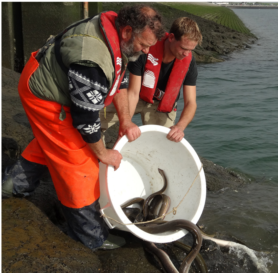
Mature eels are stocked “over the dike” in the sea.

As one of the most technologically advanced forms of aquaculture in the world, eel farming saw an initial rapid growth in production up to the early 2000s. In the past decade, however, the industry has been facing a series of challenges that could damage its future outlook. Farmers are now striving to find new ways to secure the future of European eel production in a more sustainable way.