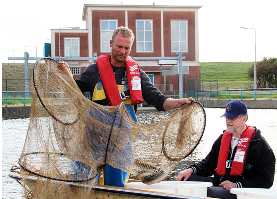
Mature eels are caught in front of a pumping station that blocks their migration to the sea.

To survive, the eel industry has come to the realization that it will have to increase its restocking efforts, either by itself or as part of the national eel plans, and take additional measures to help the recovery of the eels.