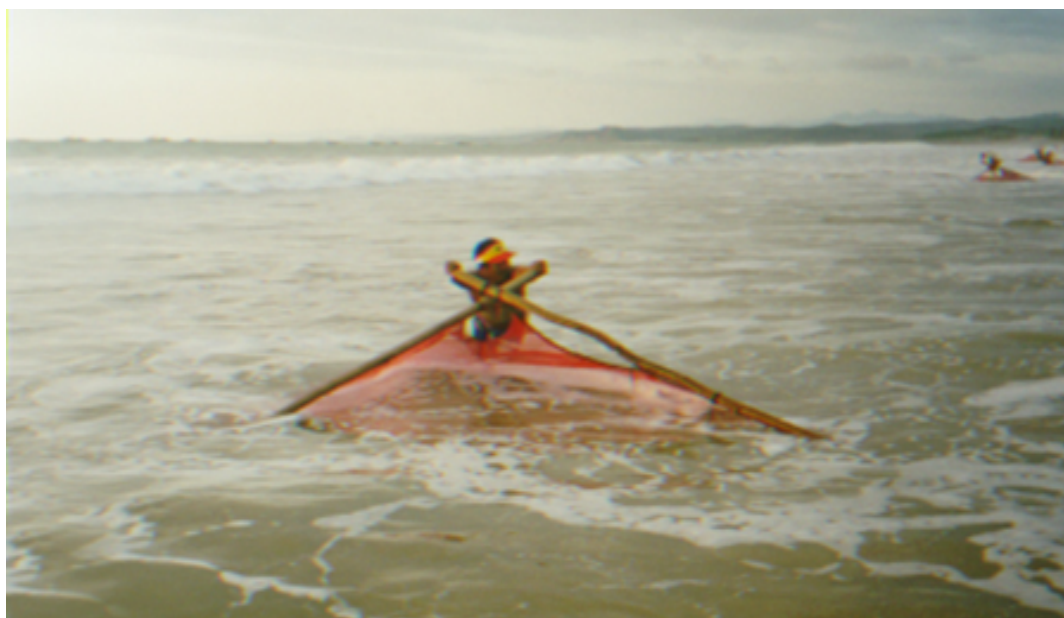
Wild postlarvae are collected in scissor nets in shallow waters off the coast of Ecuador.

Over the past 30 years, Ecuador has developed a large shrimp-farming industry characterized by extensive and semi-intensive production systems. During the 1970s and 1980s, the industry relied almost entirely on wild postlarvae (PL). However, because of the natural variability in the supply of wild PL, a large shrimp hatchery industry also developed in Ecuador.