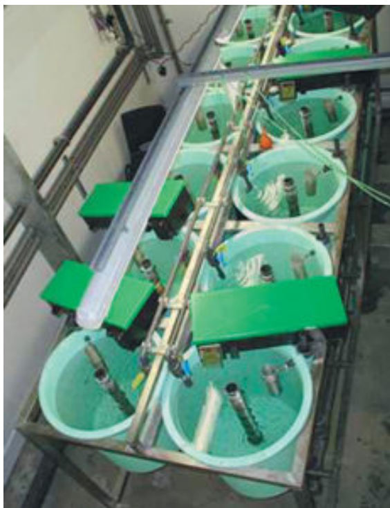
Recirculating system used in the study.