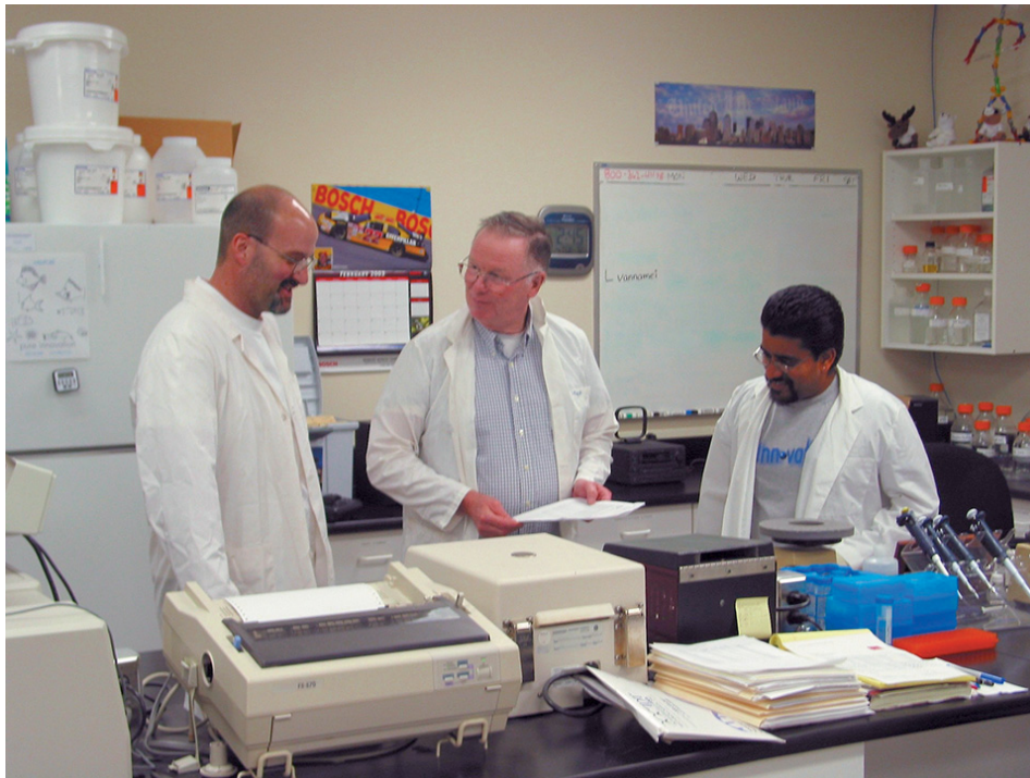
The main author (center) discusses captive breeding in shrimp with colleagues at Aquatic Stock Improvement Co.

A significant factor in the continued growth of aquaculture will likely be the domestication of production stocks and selection of broodstock that display traits of economic importance. Without such improvements, the industry will not be able to cash in on increases from production efficiencies. Instead, it will grow in an inefficient and unsustainable manner through significant increases in the area under production.