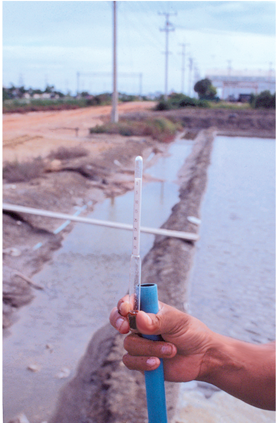
Measuring salinity of brine at a salt farm in Thailand.